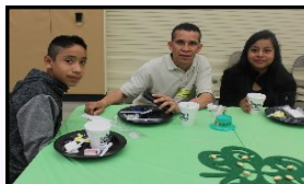
Feast for Fathers 2016