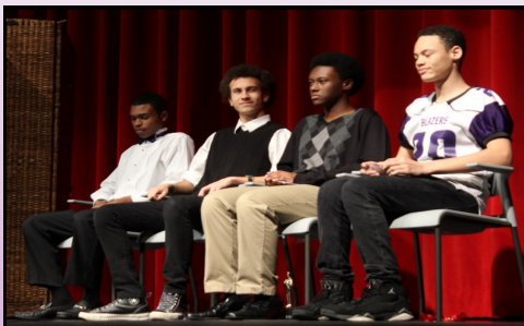
"The Dating Game" Freshman Parent Information Night