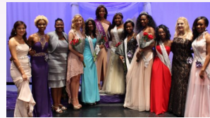
Miss Ridge View