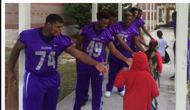
Blazer Football @ RCE