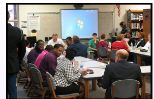
Career Day 2016