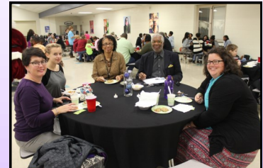
Giving Bowl 2015