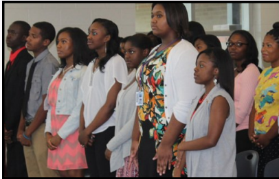
National Honor Society