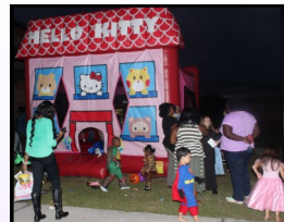
Trick or Trunk 2015