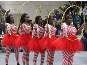
Winter Wishes 2015