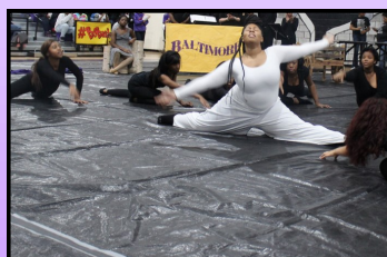
Black History Program 2016