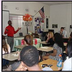
Career Day 2016