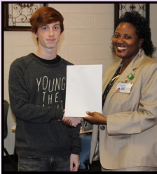
Student of the Month