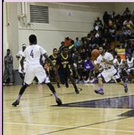
Bojangles Bash 2015