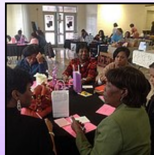
Mother Daughter Tea