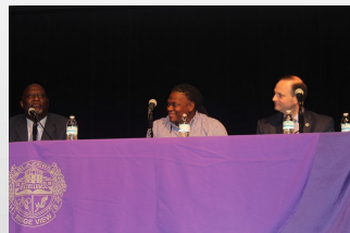
Domestic Violence Town Hall