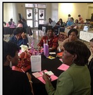
Mother Daughter Tea