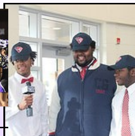
Signing Day 2015