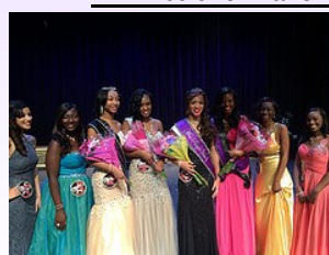
Miss Ridge View