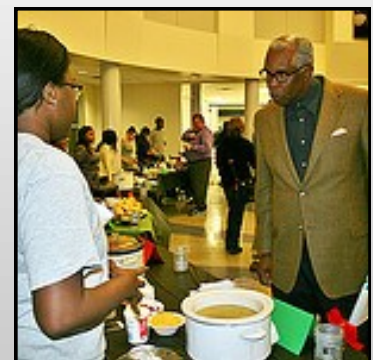
Giving Bowl 2014