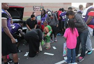
Trick or Trunk 2014