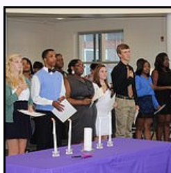
National Honor Society