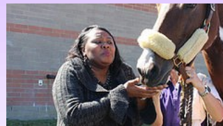
Kiss the Blazer 2014