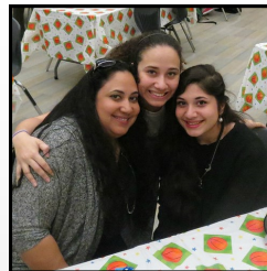
Muffins for Moms 2015