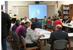
Career Day 2015