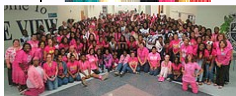
Pink Out for Breast Cancer 2014