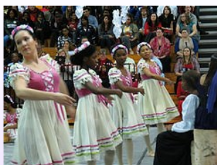
Winter Wishes 2014