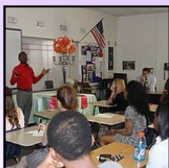
Career Day 2014