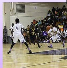
Bojangles Bash 2014