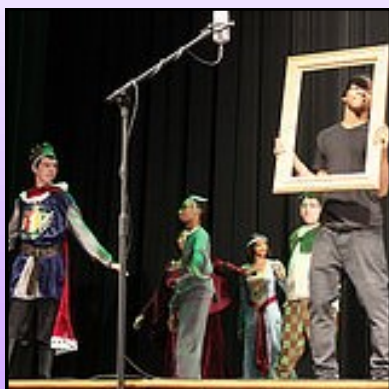
Art Leadership "Shrek"