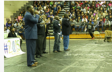
Black History Program 2015