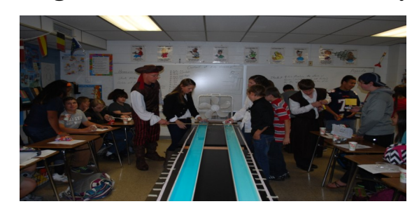
Integrated and Hands-On Activities