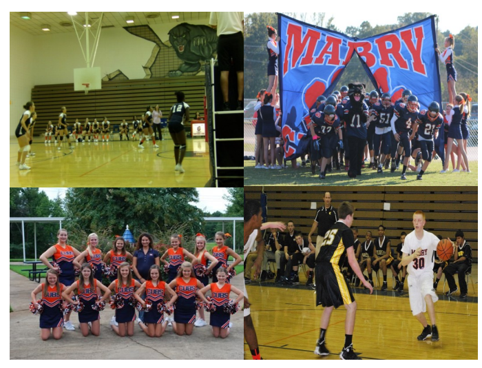
Clubs and Organizations