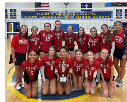
Girls Volleyball Team: Peachtree Conference Tournament Runner-up