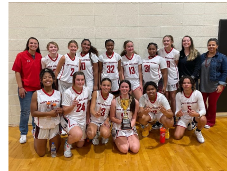
Girls Basketball Team Pre-Season Tournament Champions